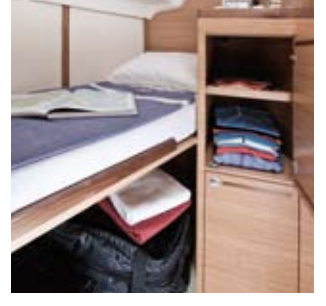
SAILOR'S CABIN The sailor's cabin with bunk beds accommodates two and features ample space for storage.