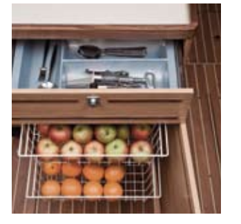
STORAGE Storage is generous around the galley and saloon, with well thought solutions for storing fruit, bottles and other kitchen appliances.

COMFORTABLE ON DECK AND LUXURIOUS BELOW.