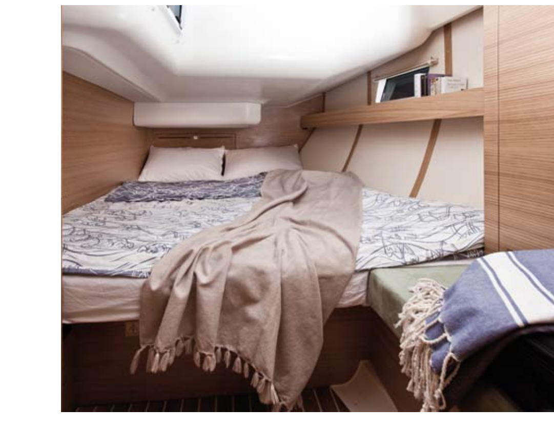
AFT CABIN The aft cabin offers a large double berth, plenty of storage space and a bright interior.

WITH INTERIORS THIS COMFORTABLE, YOU WILL FEEL LIKE YOU NEVER LEFT HOME. EXCEPT YOU'LL BE ON VACATION, CRUISING.