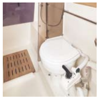
HEAD COMPARTMENT The main head compartment is airy and bright and offers a separate shower stall.