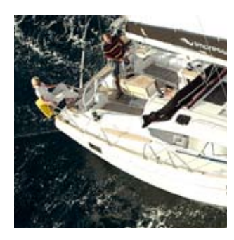
COCKPIT PROTECTION The cockpit is well protected from sprays by high cockpit sidewalls, which in turn ensure more safety for the younger crew.