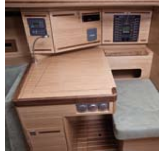
NAVSTATION The navstation features ample space for paper charts storage under the large navigation table.