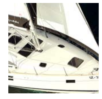
SUNBATHING DECK Plenty of space forward and around the cockpit for sunbathing and reveling in the pleasures of sea going.